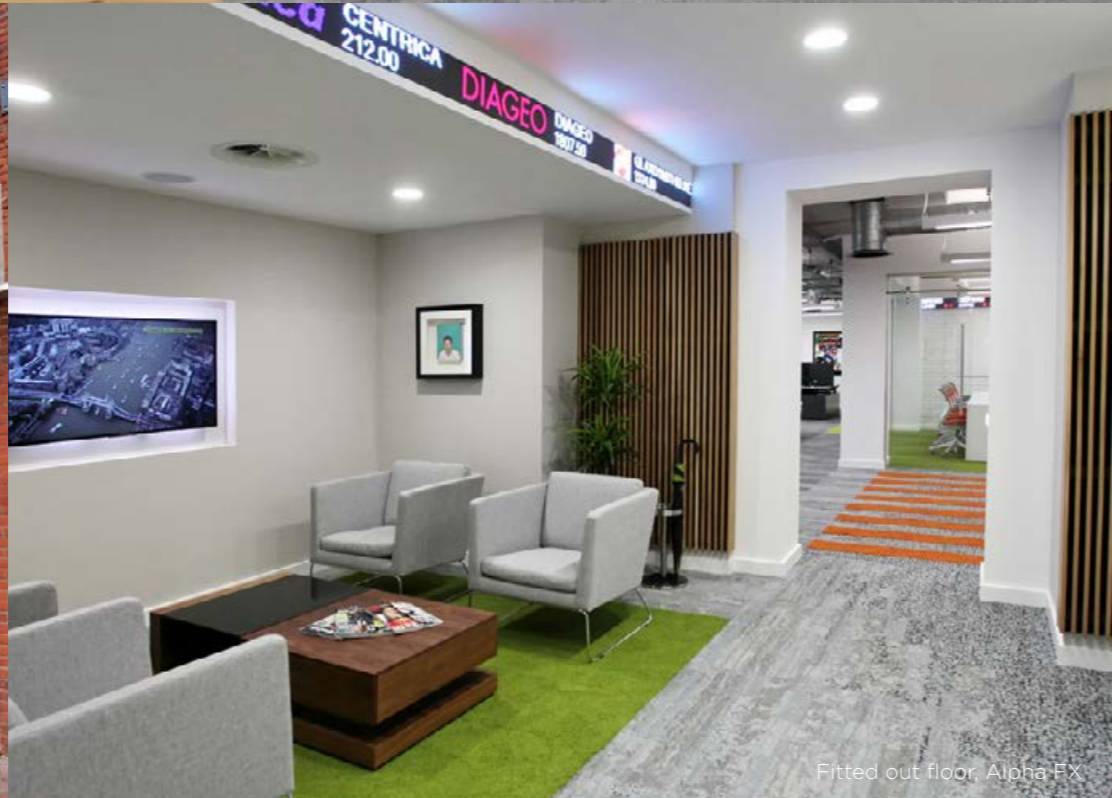
Fitted out floor, Alpha FX