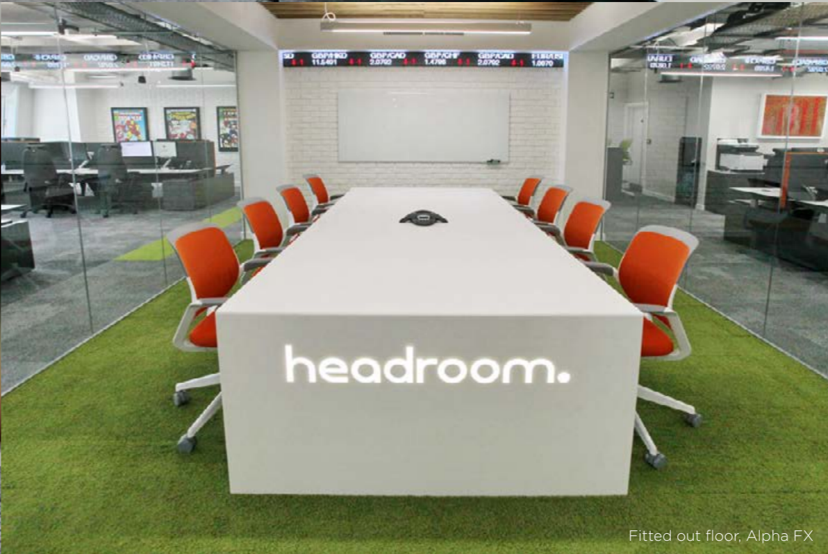
Fitted out floor, Alpha FX